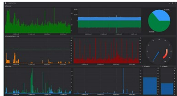
"At-A-Glance" Overhead Dashboards